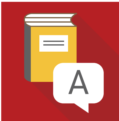
Language and Literature