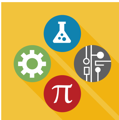
Science, Technology, Engineering and Math