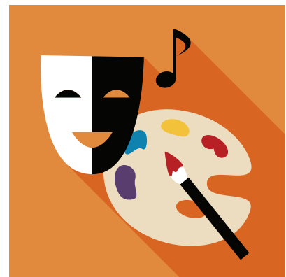
Visual and Performing Arts