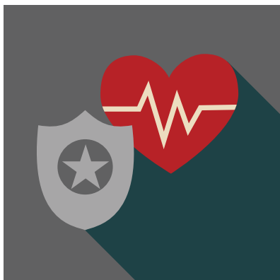
Public Safety, Health and Wellness