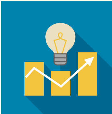
Business and Innovation