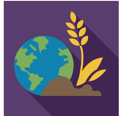
Earth and Environment