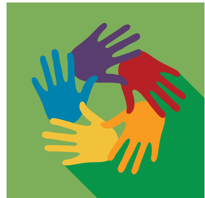
People, Culture and Society